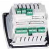
Mains unit in wall housing