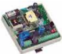
Mains unit on DIN rail