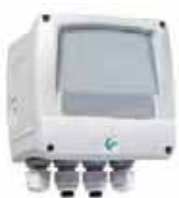
Mains unit in wall housing